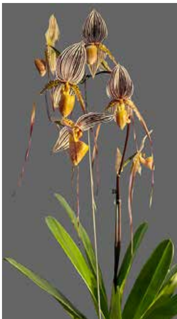
Paph. St. Swithin