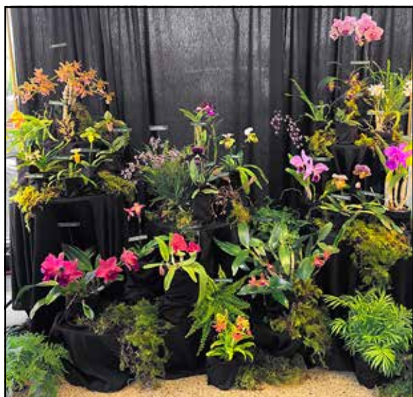
Display before and after judging.